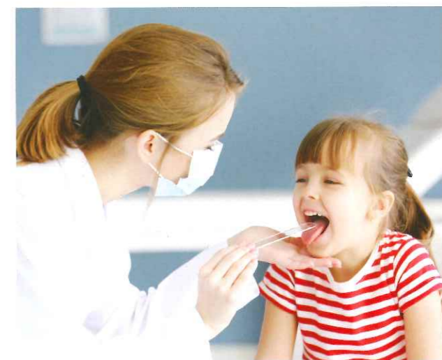
Cepheid's test ensures that children are only prescribed antibiotics when they are needed.

One problem with antigen tests is that, if the staff don't go back to check the result in time, they have to do it again. With our test, it doesn't matter if you didn't get back in time as the answer has already been determined and it's on the computer screen. At the same time, because